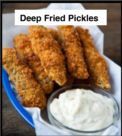
Deep Fried Pickles